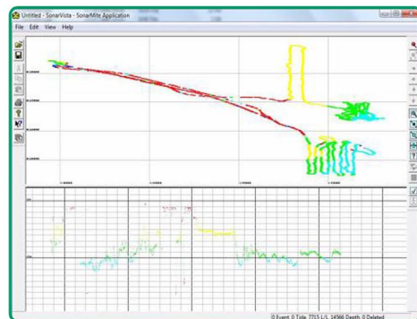
SonarVista Processing Software